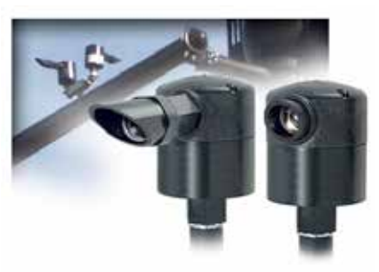
STROBECOM II Optical Preemption Detectors, Tomar Electronics Inc.