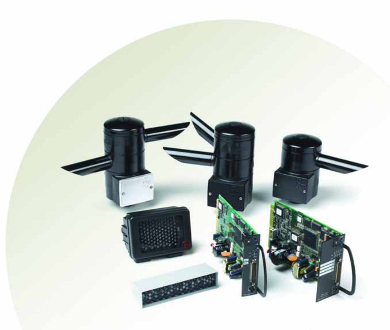
Opticom™ Infrared System components: detectors (top), emitters (left), phase selectors (right).

Contact Global Traffic Technologies to learn more about service, maintenance and turnkey solutions in emergency vehicle preemption and transit signal priority that improve the quality of life for everyone in the community. Call 1-800-258-4610 , or visit us at gtt.com . The method of using the components of the Opticom™ Infrared System may be covered by U.S. Patent Number 5,172,113 and Canada Patent Number 2,079,293. The use of Opticom infrared system components may be covered under one or more of the following U.S. Patent Numbers: 4,970,439; 5,187,373; 5,187,476; 5,202,683; D338165.